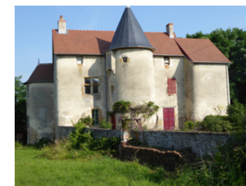
castle of Rémilly