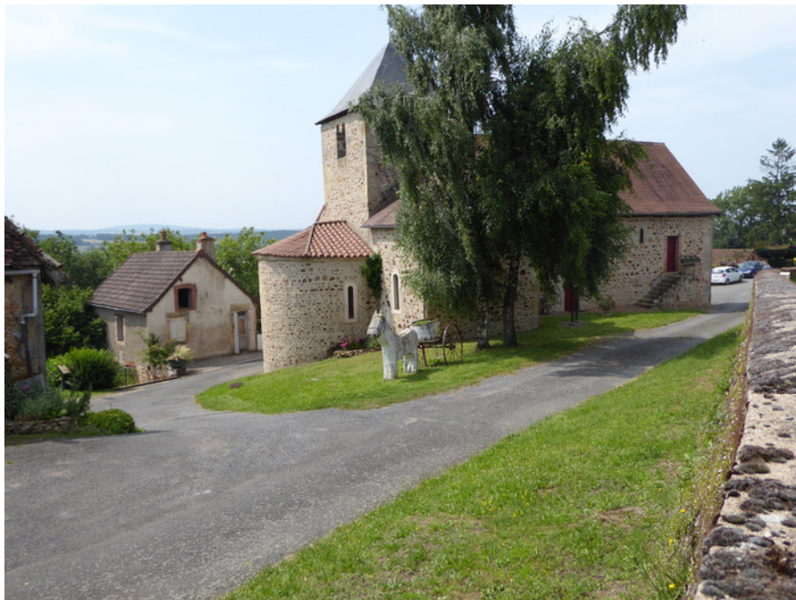
church of Lanty